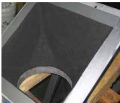
Protection for chutes and hoppers

It is a seamless solvent-free material which upon curing will not shrink, expand or distort.